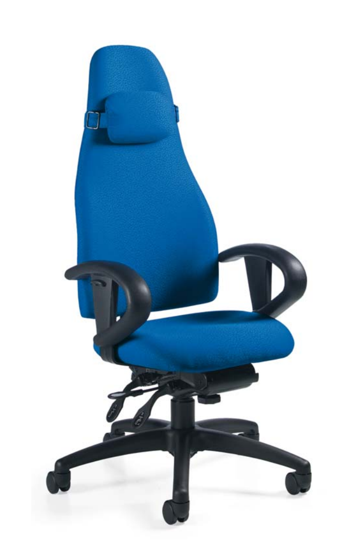
4470 High Back Knee-Tilter with optional 9S arm